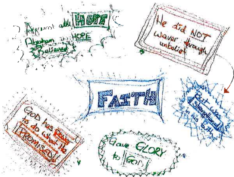
#1: Names or attributes of God

Prayer doodles can help you focus on praising and worshiping God, listening for his promises to you.